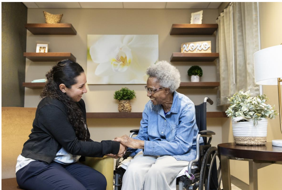
A private den provides a comfortable space for patients to meet with members of their care team.