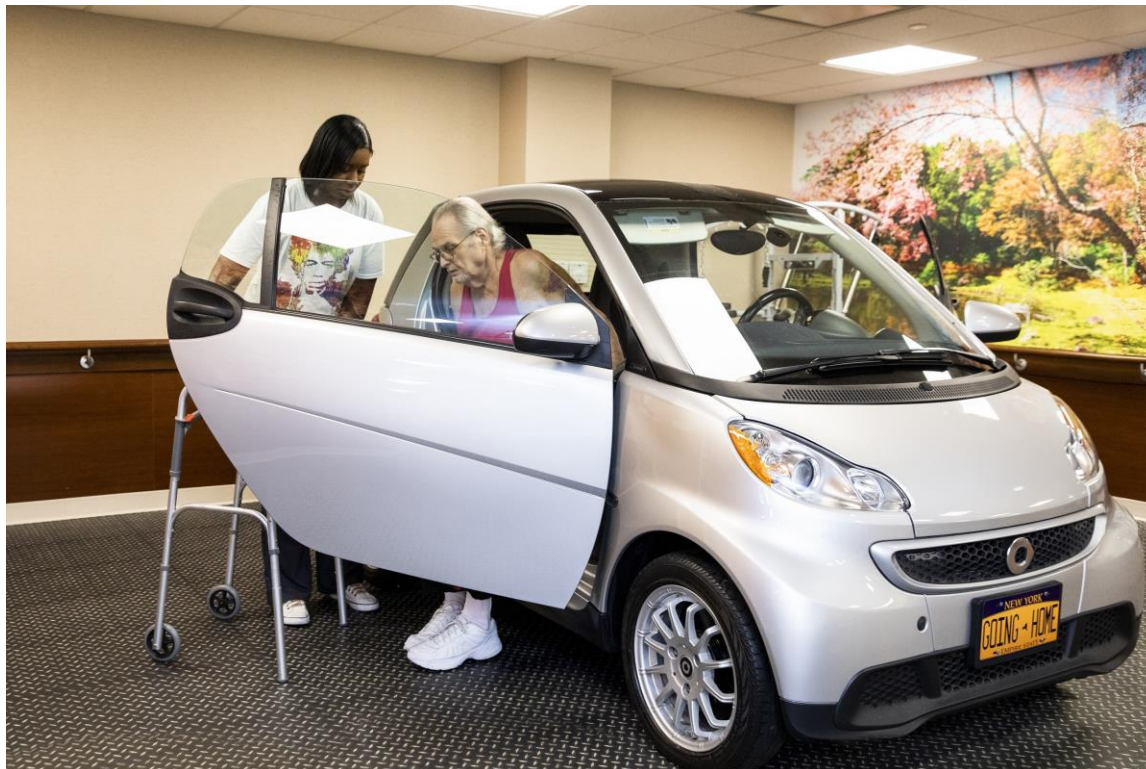
Occupational therapists teach patients how to make safe car transfers.