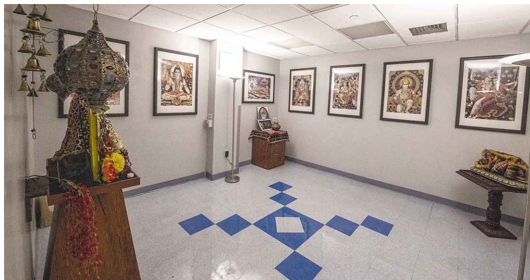
The prayer room ensures that residents’ various religious preferences are met.